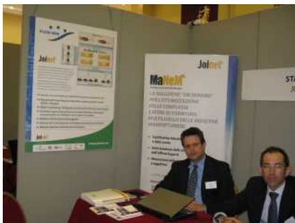
Fig. 4: Joinet stand at the Global Logistic Forum

The interest of stand visitors and speech attendees has been good, and these contacts are now in the Joinet prospects list, to be contacted in the next months for further contacts. Attendees were companies from both manufacturing and logistic sector.