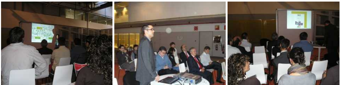
Fig. 1: Impressions from the presentation at Labein

The FLUID-WIN project results were presented at a workshop held at the LABEIN premises in Bilbao on 23 rd October 2008 with participation of several local companies and representatives from some industrial associations (fig. 1, table 4).