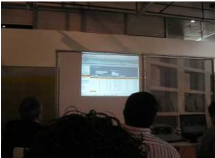
Fig. 2: Presentation of the FLUID-WIN prototype

Some of the comments and discussions held among the participants were related to these topics: